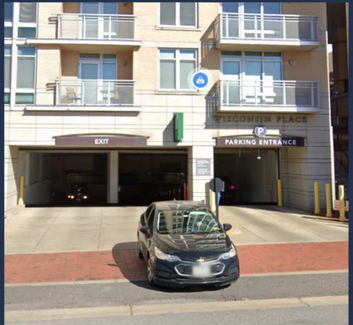
(Outside of the parking garage)